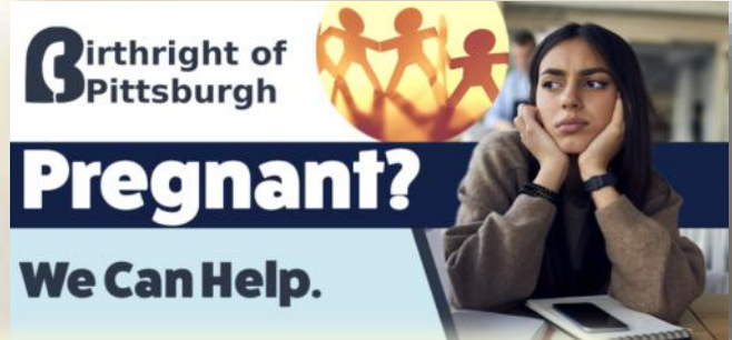
Billboard designs by Lamar Advertising