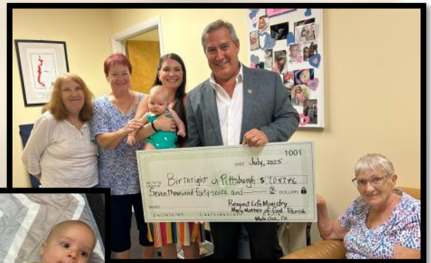
♥ Mary, Mother of God's Respect Life Committee stopping in for our open house & bringing a very generous donation! (above)