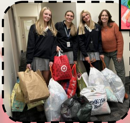
♥ The Pro-life club from Oakland Catholic dropping off a Winter Clothing Collection!